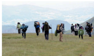
The questers set out to find their own piece of wilderness

Sitting on my mountain I'm not feeling very spiritual – because I'm so hungry. I have three bottles of water with me, and I sneaked a few pumpkin seeds into my rucksack, but today, on my final day, I have to return to base camp, in the Basque village of Saint-Martin-d'Arrossa outside Biarritz, and I'm wondering how I'm going to find the energy to dismantle my tent, let alone trek five hilly kilometres back to meet my fellow questers.